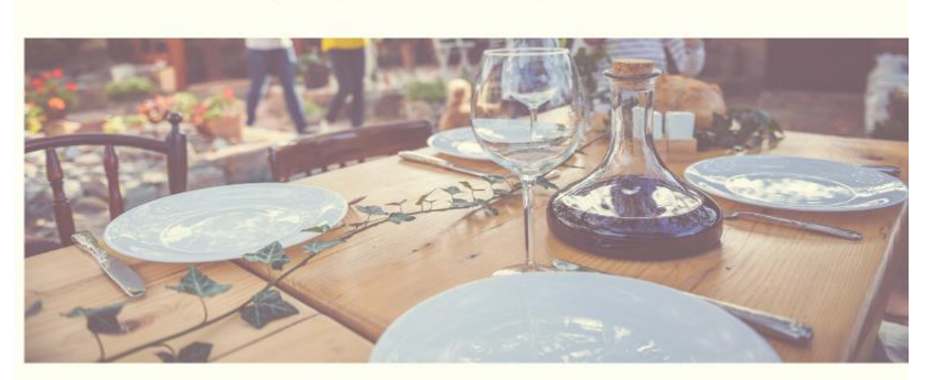
There's a chair waiting for you