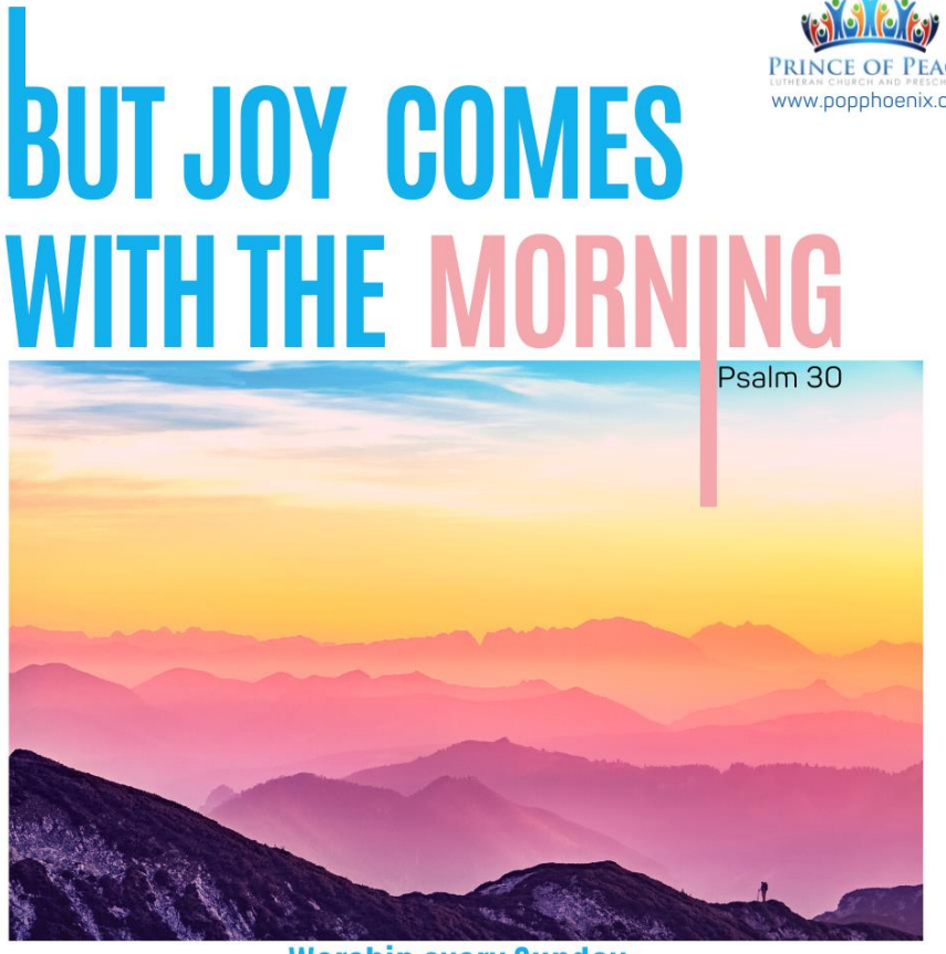
Worship every Sunday: 7am on YouTube, 9:30 am in the Sanctuary

Join us next and every Sunday for Worship at 9:30 am in the Sanctuary. 7:00 am Online Worship, YouTube (HLMP-hymns, lessons, message, prayers) 9:30 am In person Worship, Sanctuary (Holy Communion is celebrated at the 9:30am service. If you'd like communion delivery please schedule through the church office.)