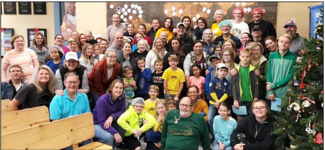
Feed My Starving Children on November 30.