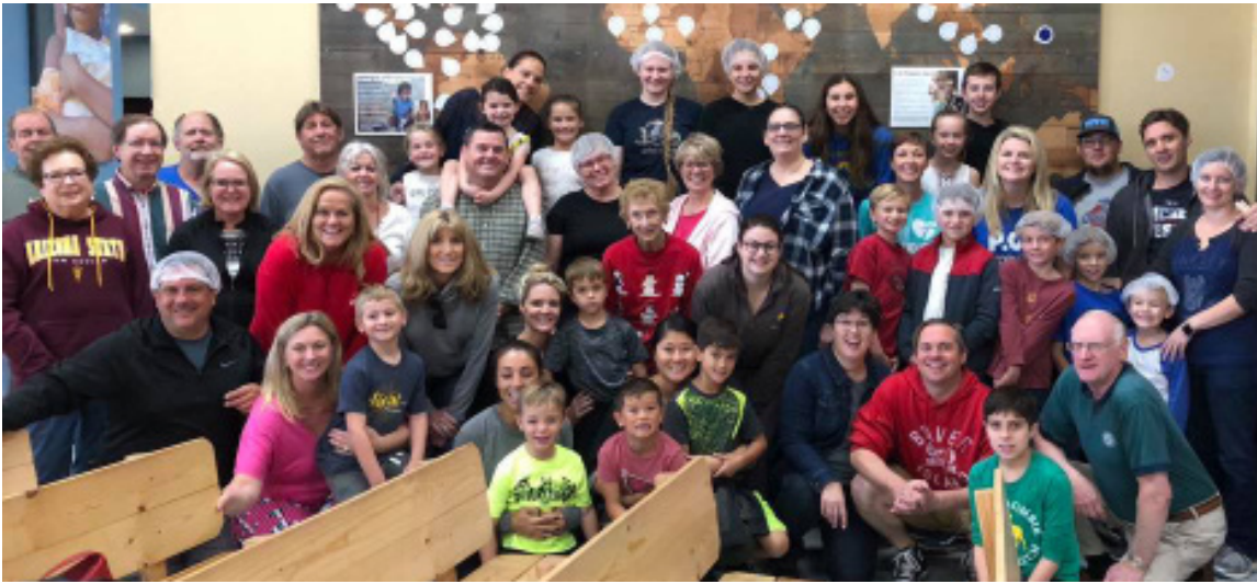
On December 1, POP helped pack enough FMSC food to feed 94 kids for a year!