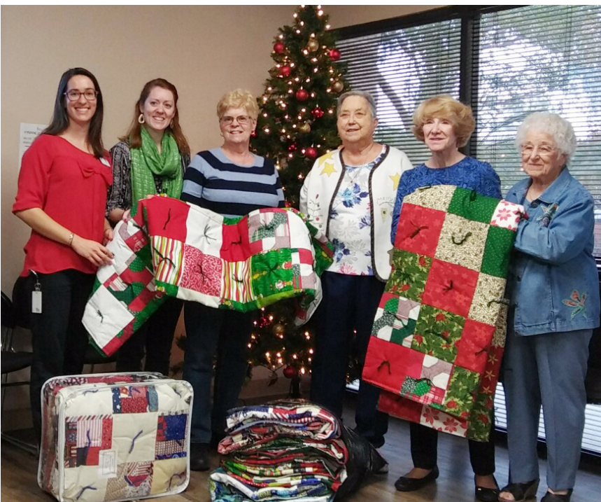
Our Sew and Tie group dropped off 11 handmade quilts at Lutheran Social Services of the Southwest. The quilts will be given to seniors in need.

The Elderberries are in the process of planning an outing on Wednesday morning, February 27. Watch the Sunday bulletin and the February Messenger for details but for now just save the date.