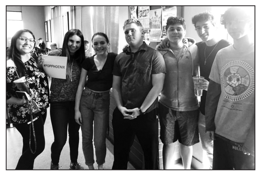
High School Youth Group on a recent Scavenger Hunt

10th Grade — G.A.P. Camp (Camper and Leadership Experience)