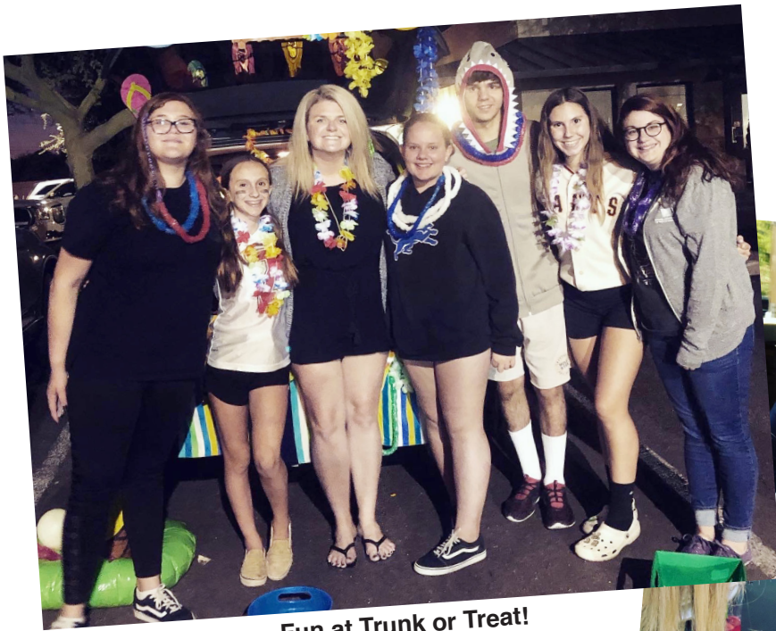
Fun at Trunk or Treat!