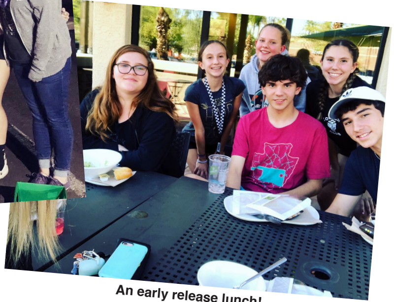
An early release lunch!