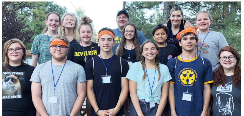
Prince of Peace Youth

Download the Taking Faith Home paragraph on our website: www.poppheoenix.org/children-youth/parents-and-family .